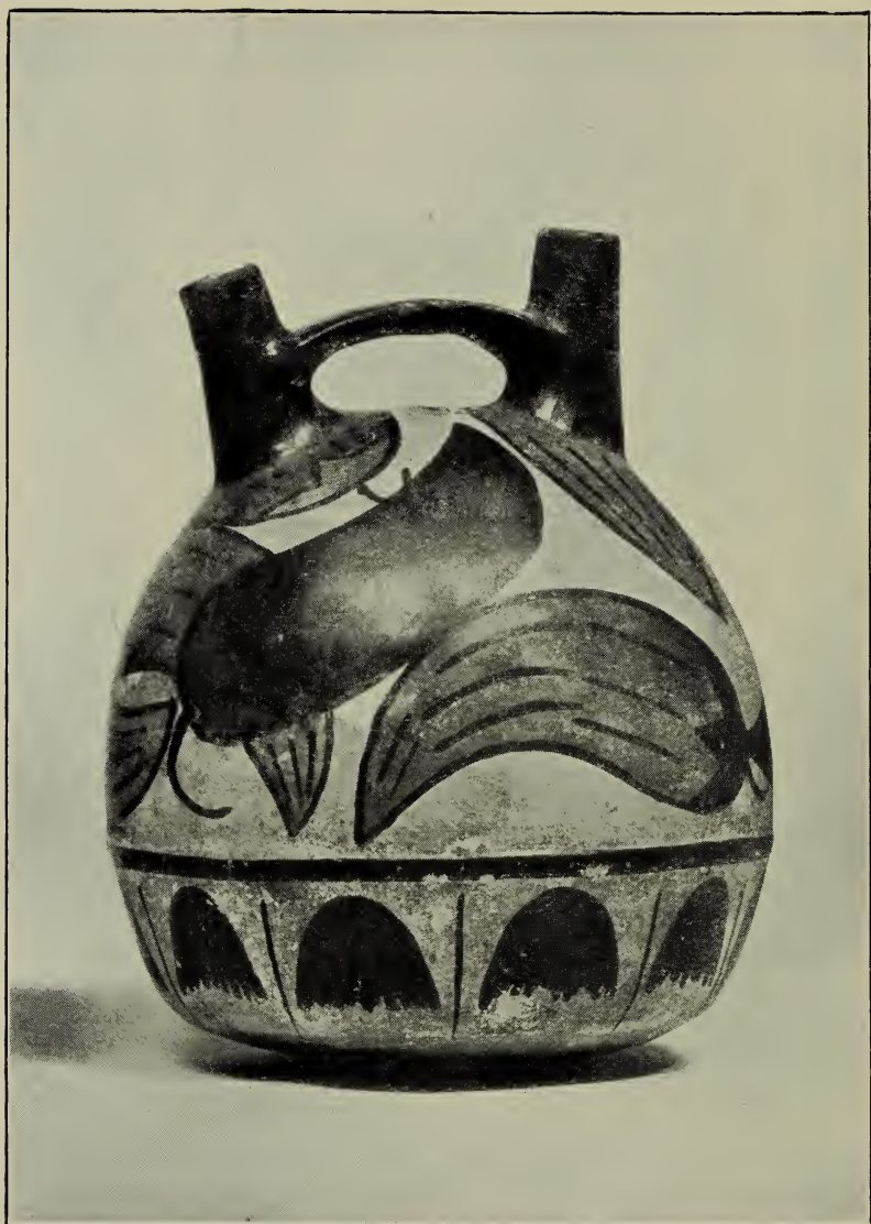
EARLY PERUVIAN POT FROM THE NASCA VALLEY